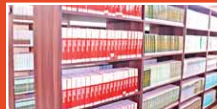
Publication by AGU Faculty