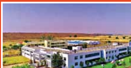
RNTU Bhopal (MP)