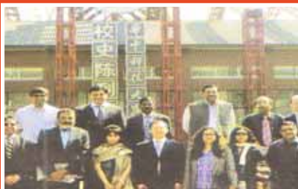
AGU in Chinese Universities