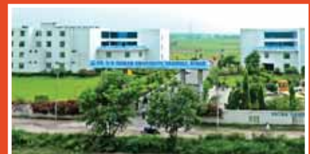
CVRU Vaishali (Bihar)