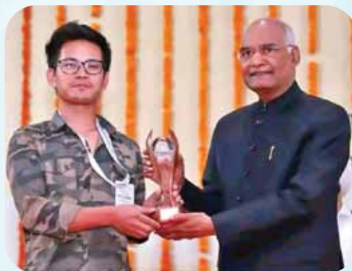
National Award for inventing Goggle for Blind

Application oriented IPR aligned with concept of New India and Atma Nirbhar Bharat