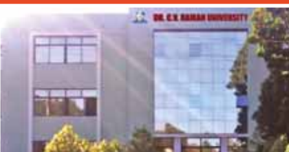
CVRU Bilaspur (CG)