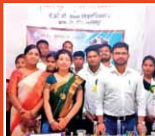
Local To Global