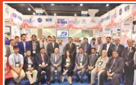
AGU in American Universities