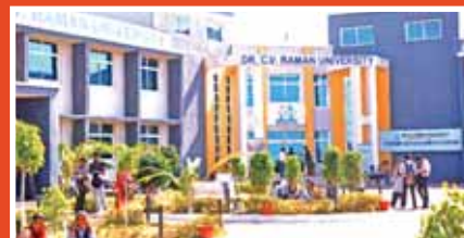
CVRU Khandwa (MP)