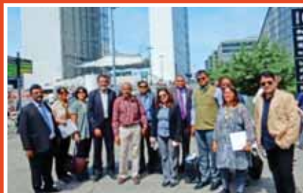
AGU in European Universities